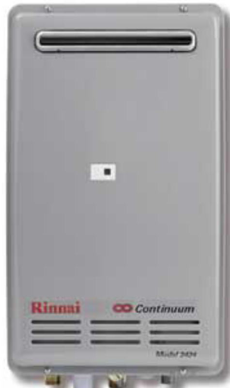
Model 2424WC - External Commercial