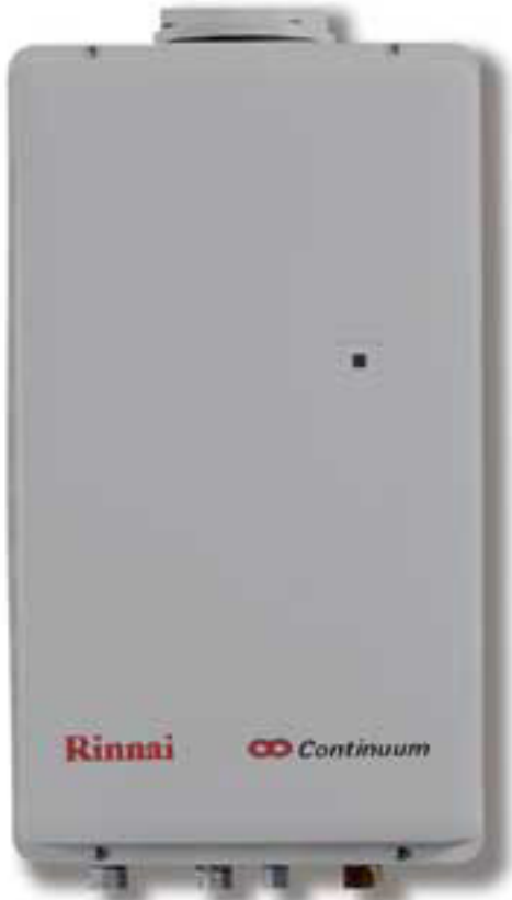
Model 2532 FFU "C" - Internal Commercial